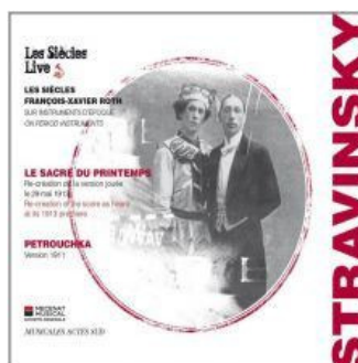
STRAVINNSKY The Rite of Spring. Petrushka